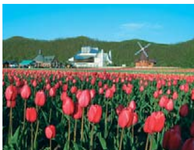
Tulip (Tulip Park) Mid to Late May