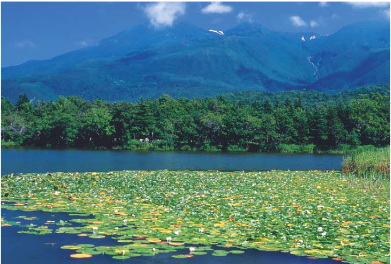
Shiretoko Goko Lakes with lotus flower

"Okhotsk" is not a city name, but the area name with 19 cities, towns and village. This Okhotsk region is 12.8% of Hokkaido -10,689 square kilometers, and 320 thousand people live there. Okhotsk faces the Sea of Okhotsk. The climate is calm from spring to autumn and the annual average rainfall is little -around 800mm. The hours of sunlight is long, so you can see a pure blue sky named "Okhotsk Blue" when it is fine day. This pure blue sky make natures like forests, flowers, lakes, seas to signalize these colors. You will be surely touched with these Okhotsk colors. Floating ice flows into the Sea of Okhotsk in every winter season (January to March). Here is the southernmost place to see the floating ice and it is one of the features in this region. Regarding to the local basic industries, here is proud of its No1 fishing catches in fishery throughout of Hokkaido. Besides the fishery, here is also famous in Japan for its extensive and high quality resources in the farming areas and forests. Due to these sufficient natural resources, many attractive products can be created and used extensively by people. The blue sky of Okhotsk makes forests, flowers, lakes, and oceans much brighter. In addition, the beautiful nature makes a vivid impression on people.