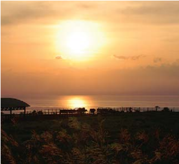
Sunrise at Cape Notoro