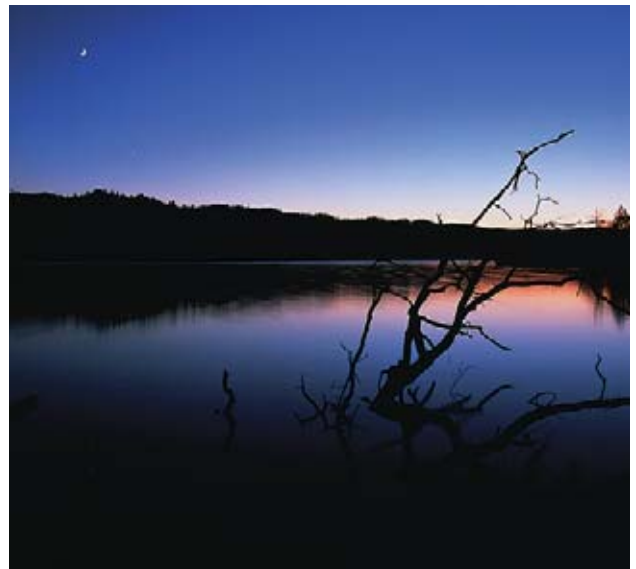
Twilight in Lake Chimikeppu