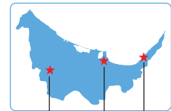
Onneyu Hot Springs (Kitami)