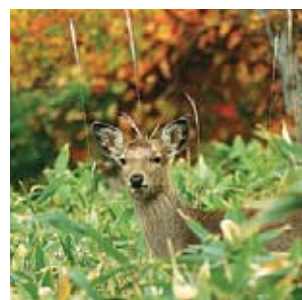
Ezo shika deer