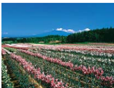
Lily (Koshimizu Lily Park) Mid July to Early September