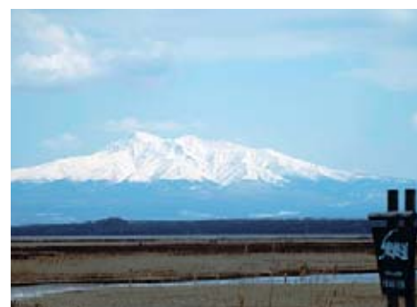
View of Mt. Shari from Lake Tofutsu

Lake Tofutsu has a circumference of 27.3km and covers an area of 900 hectares. Originally a bay of the Okhotsk Sea, it would become a lake at low tide when a sand bar would cut it off from the sea. Over time, the sea stopped coming over the sand bar and Lake Tofutsu was born. Even now, part of the Lake is connected to the Sea of Okhotsk and so there is a combination of both river and sea water in the Lake. As a result, the plants around the Lake have characteristics of those from both fresh water and salt water marsh areas and along with Koshimizu Natural Flower Garden, the resulting abundance of flowering plants draws many tourists. In addition, there are many shellfish in the Lake like Japanese corbicula and oysters and many varieties of insects that can only be seen here. Wild ducks and swans fly here while in the winter white-tailed eagle and steller's sea eagle migrate here.