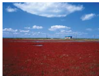
Glasswort Mid to Late September