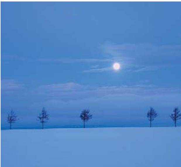
Meruhen-no-Oka in Winter