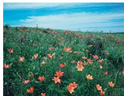
Ezosukashiyuri (Ikushina Primeval Flower Garden) Late June to Mid July