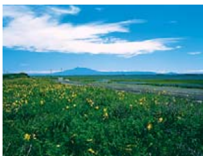
Primeval Flowers (Koshimizu Primeval Flower Garden) Late June to Mid July