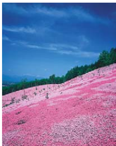
Moss Phlox (Takinoue Park) Mid May to Early June