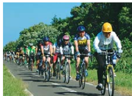
International Okhotsk Cycling

There is a Cycling competition that races from Oumu to Shari, approximately 212 kilometre sand taking 2 days. The objective of this race is not just to make the best time but to enjoy the scenery and the interaction with the other competitors while completing the race. Travelling with the fresh Okhotsk wind, the route takes cyclists past the Okhotsk Sea, Lake Saroma, Lake Notoro, and Lake Abashiri.