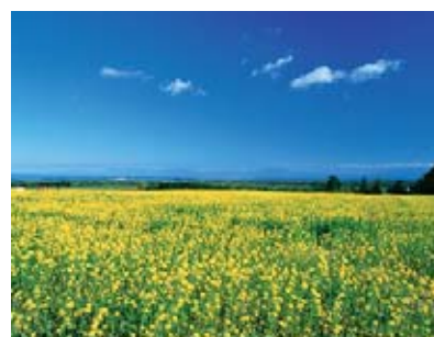
White Mustard August