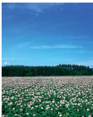
Potato Flower Mid July