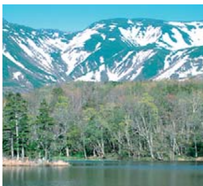
Shiretoko Goko Lakes